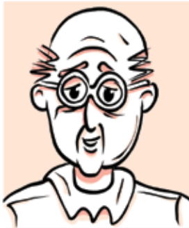
DOC, SHIP'S DOCTOR