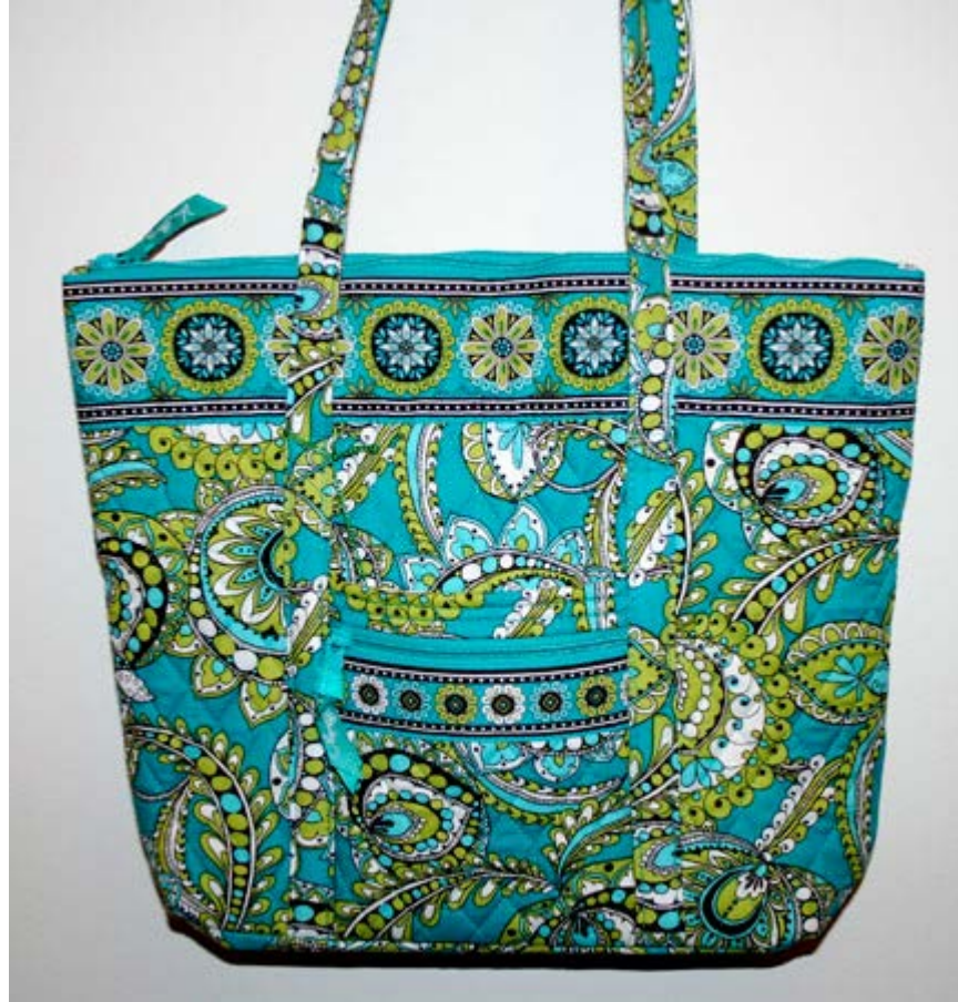
Paisley handbag associated with the boho look