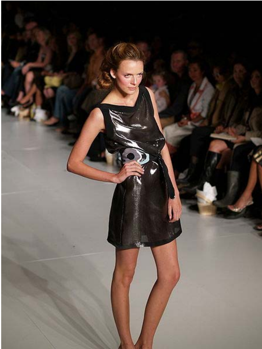
Haute couture dress from spring 2006

For teenagers short hair like the buzzcut was popular in the early 2000s. In the mid 2000s longer hair became popular, including the wings (haircut) inspired by surfers and British indie pop stars. In the late 2000s the androgynous Harajuku inspired scene hairstyles (often dyed bright colors) and eyeliner have become popular among girls and boys alike. As an alternative to the scene hairstyles, teenage girls opted for a preppy hairstyle that involved long, straight hair, side-swept bangs and a side part, while boys wore side-swept surfer hair.