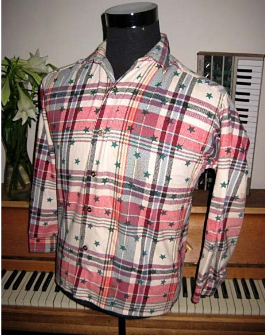
Slim-fitting plaid Western shirt gained popularity in the UK from 2008 onwards.