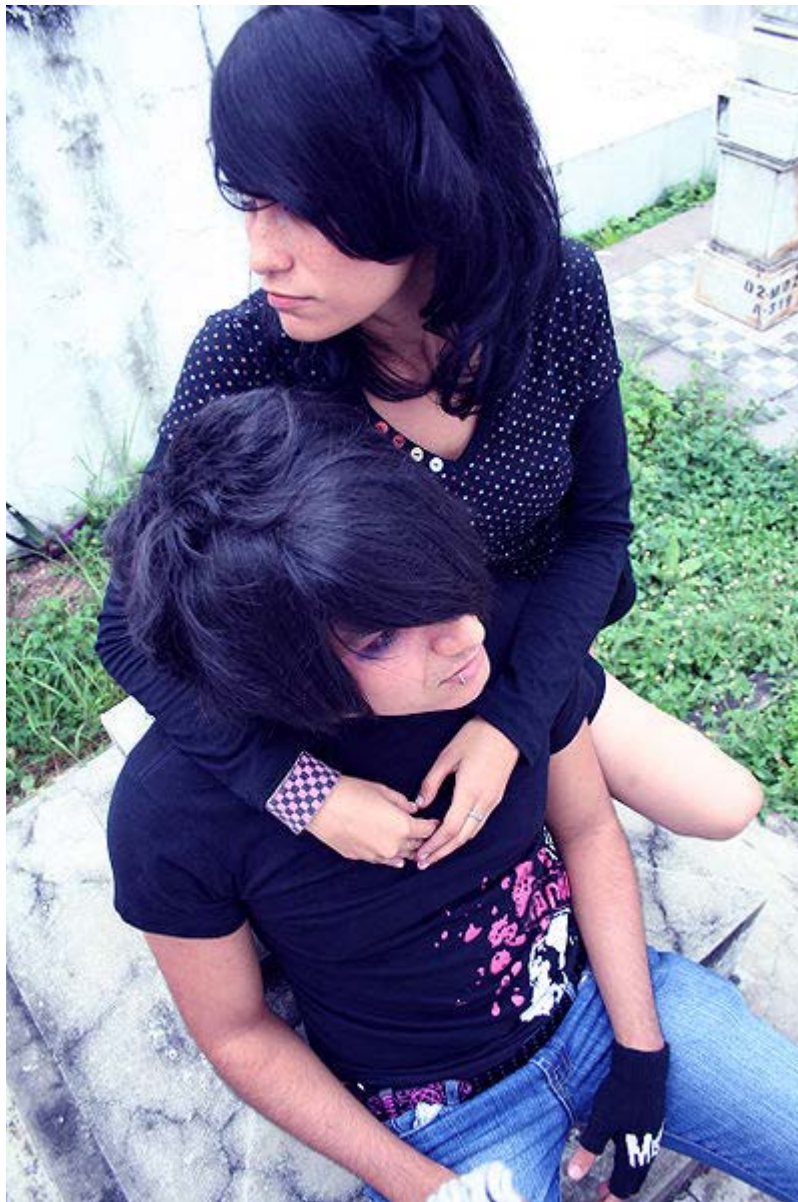
Emo kids from the late 2000s