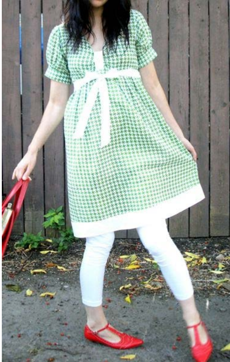
Modern leggings came into fashion in the late 2000s