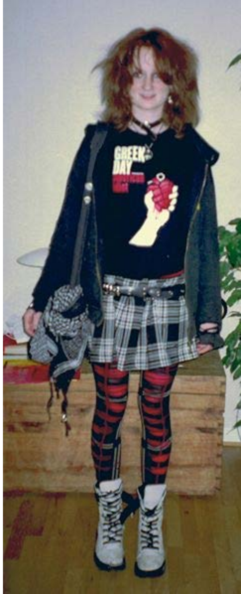
German Mosher, the more punk-like incarnation of scene, early-mid 2000s