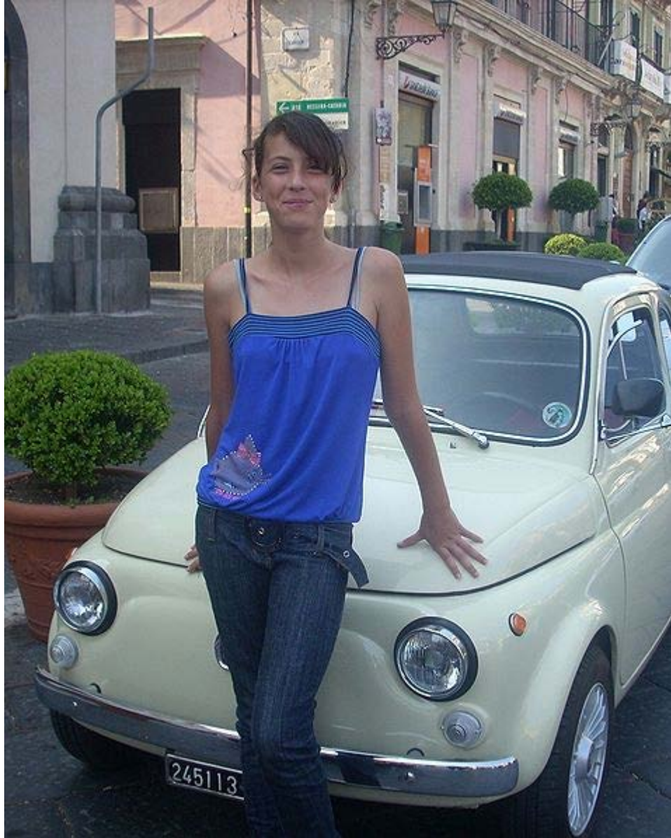
Girl wearing skinny jeans, 2008