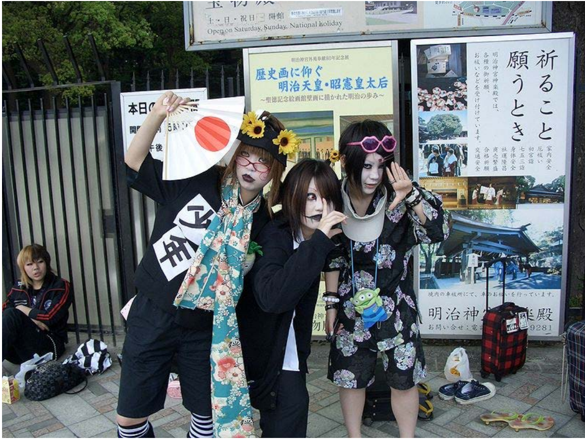
Japanese teenagers on Harajuku Bridge