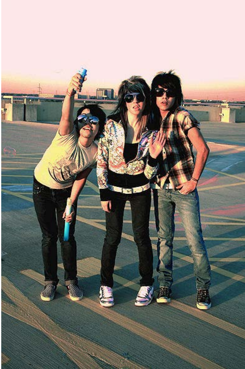
Scene Kids, late 2000s