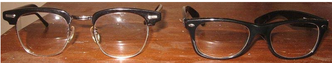
Vintage-style "nerd glasses" made a comeback in 2009