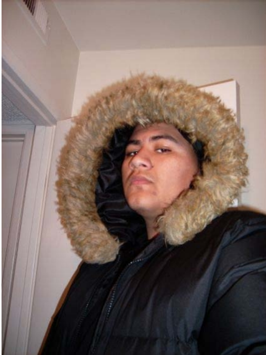
Mexican rapper in fur-lined parka, 2008