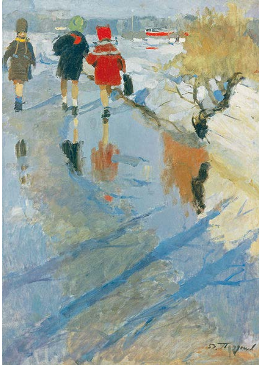
"Spring day" by Nikolai Pozdneev

Art exhibitions of 1935 - 1940 disprove the claims that artistic life of the period was suppressed by the ideology and artists submitted entirely to what was then called 'social order'. A great number of landscapes, portraits, genre paintings exhibited at the time pursued purely technical purposes and were thus ostensibly free from any ideology. Genre painting was also approached in a similar way.