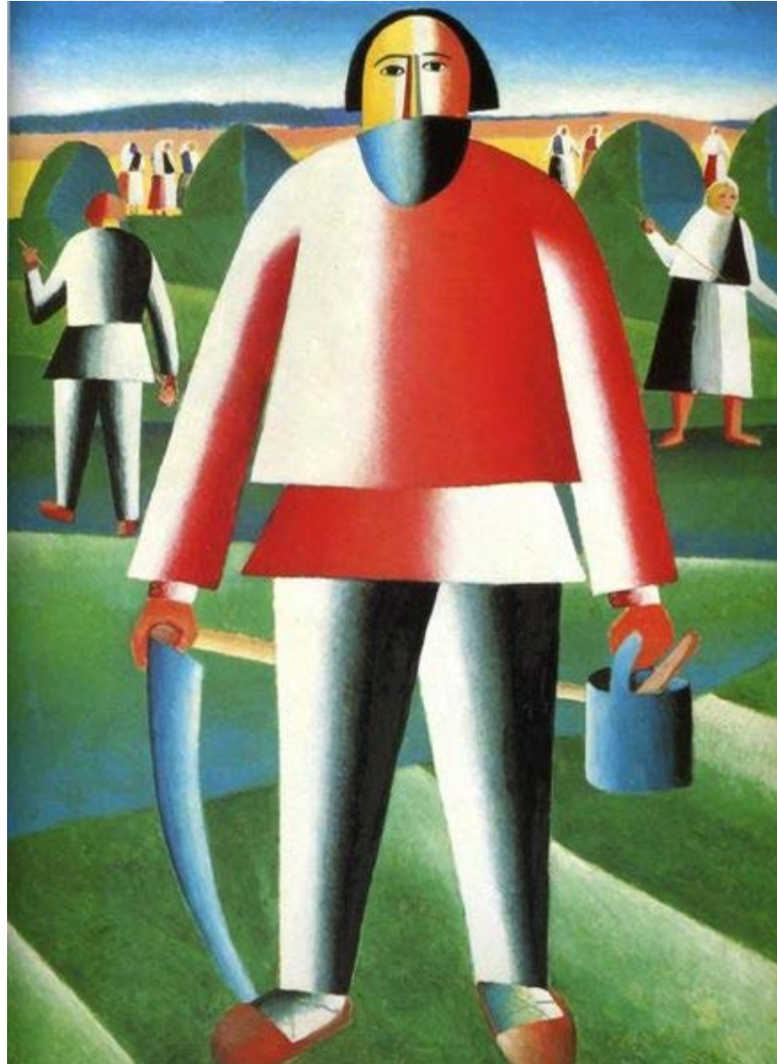
Mower by Malevich, 1930

The ideas of Proletkult attracted the interests of Russian avantgarde, who strived to get rid of the conventions of "bourgeois art". Among notable persons of this movement was Kazimir Malevich. However the ideas of the avantgarde eventually clashed with the newly emerged state-sponsored direction of Socialist Realism.