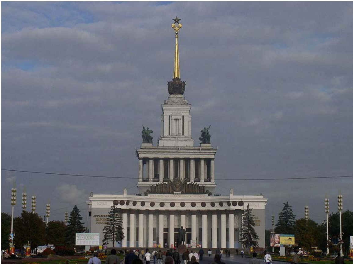
All-Russia Exhibition Centre in Moscow

In conjunction with the Socialist Classical style of architecture, Socialist realism was the officially approved type of art in the Soviet Union for nearly sixty years. All material goods and means of production belonged to the community as a whole, this included