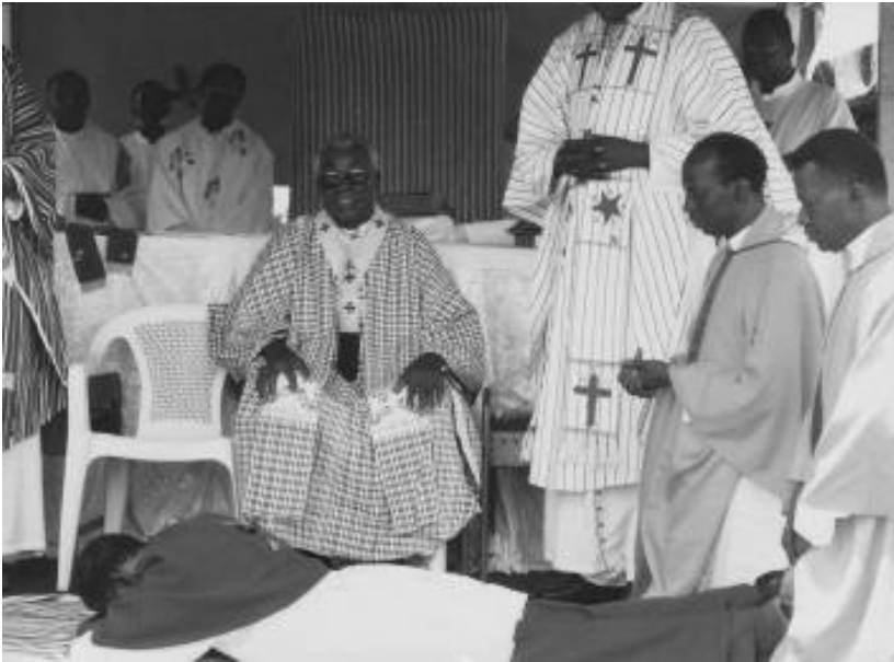
Figure 2: Cardinal Dery in 1995 presiding over the installation of Bishop Paul Bemile as the third bishop of Wa Diocese