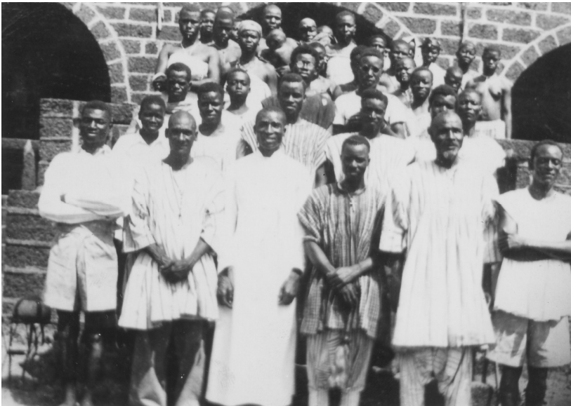
Figure 2b: Cardinal Dery family photo taken on the day of his priestly ordination at Nandim in 1951