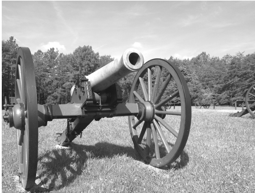
A Confederate gun stands watch at Hazel Grove on the Chancellorsville battlefield.