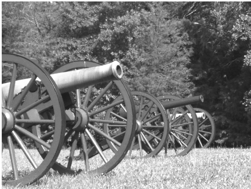
A line of Confederate guns.