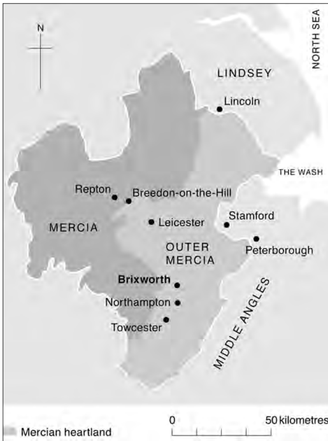
Figure 2.1: Brixworth, Northamptonshire: location within Mercia, after Stafford, East Midlands in the Early Middle Ages (1985, fig. 36).

the traditional administrative divisions of Northamptonshire and of the church within the parish are shown in Figures 12.11 and 12.1 below. Brixworth village has been considerably expanded from its traditional core, especially to the south, where several residential estates have been built in the last half century. Its original centre lies at SP 748 709 and the present village occupies the western slope of a spur of high ground on the eastern side of a northern tributary of the River Nene, which is fed by a dendritic ‘fan’ of brooks. The brooks have cut down through Jurassic strata of the Northampton Sand Formation to the underlying Upper Lias Clay that forms the valley floor (see Section 6 for a full account of the local geology). The highest ground away from the valley is overlain with Boulder Clay (see Fig. 6.1). Medieval settlement generally preferred the ironstone exposures lying between the Lias heavy clays and Boulder Clay, and Brixworth conforms to this pattern, being sited on sandy ironstone, near the head of a small brook fed by water issuing at the base of the permeable strata. The site therefore has the benefit of a ready water supply lying adjacent to good agricultural soils.