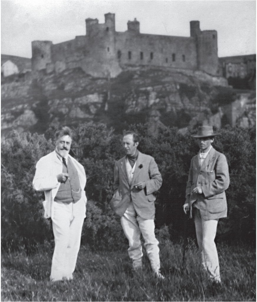
Figure 0.1 Photo of Granville Bantock, Cyril Scott and Joseph Holbrooke at Harlech in August 1917

so at the invitation of friends he went to Florence – Italy being on the side of the Allies in that war – and was delighted to find himself a celebrity. There was a concert of his works, and he was awarded a medal by the Leonardo da Vinci Society. Near the end of the war Scott went on holiday to Harlech, North Wales, with a friend – the American-born photographer and student of the occult Alvin Coburn. With Harlech Castle as a backdrop Coburn took a photo of the three composers who all happened to be there at the same time: Granville Bantock, Cyril Scott and Joseph Holbrooke (Fig. 0.1).