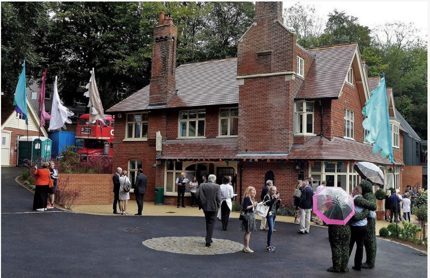
Undershaw, September 9, 2016 Grand Opening of the Stepping Stones School

As Stepping Stones School sails into its third year at Undershaw, we reflect on the unfinished and unknown tales that Sir Arthur Conan Doyle never drew to a close or was unable to complete.