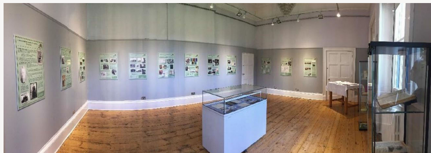
The Doyle Room at Stepping Stones, Undershaw Partially funded through royalties from The MX Book of New Sherlock Holmes Stories

LinkedIn: https://www.linkedin.com/in/emecz/