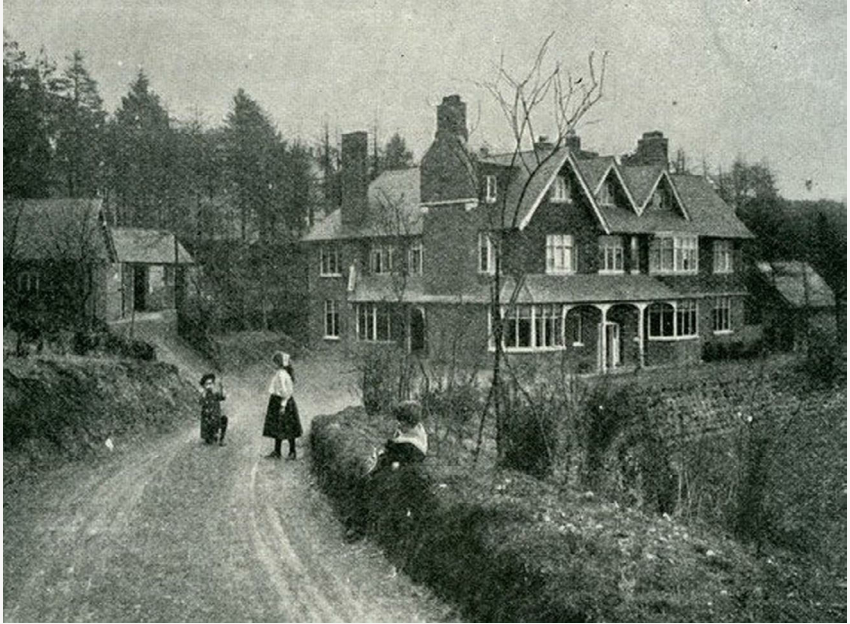
Undershaw, Circa 1900

It is three years since the first volumes of this series, and it's wonderful that we've reached Volumes XI and XII. We have raised over $30,000 for Stepping Stones School—the majority of which from the generous donation of the royalties from all the authors, but also from some interesting licensing deals in Japan and India. With this money, the school has been able to fund projects that would be very difficult to organise otherwise—especially those to preserve the legacy of Sir Arthur Conan Doyle at Undershaw.