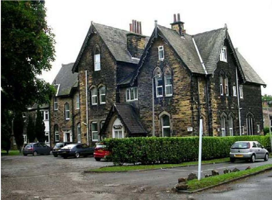
Figure 1.1: Weetwood House, Headingley.