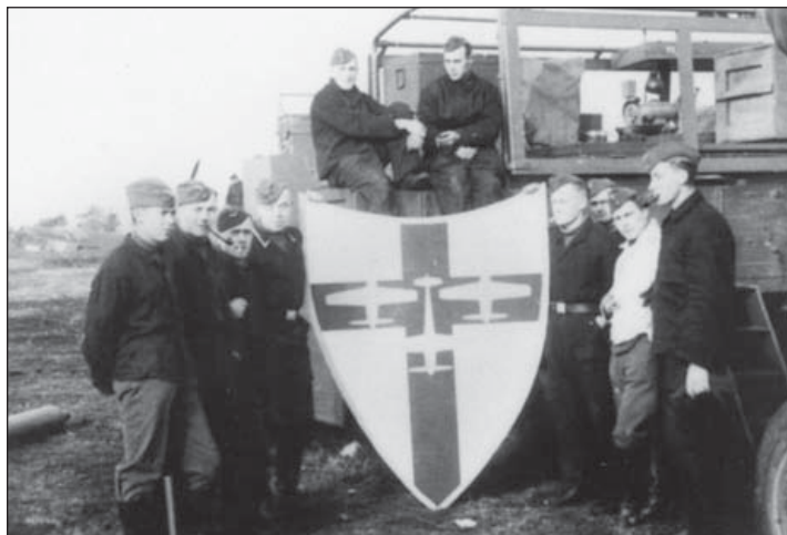
Groundcrew of I./JG 1 (as the Gruppe became on 1 May 1939) display a large-scale replica of the unit badge designed by Bernhard Woldenga and based upon the Crusaders' Cross shield of the Teutonic Knights

By mid-August 1939 the time for practising was over. Deployed at Seerappen, these machines of the Gruppenstab , with the Adjutant's in the foreground, are very much on a war footing as hostilities with Poland are only a matter of days away