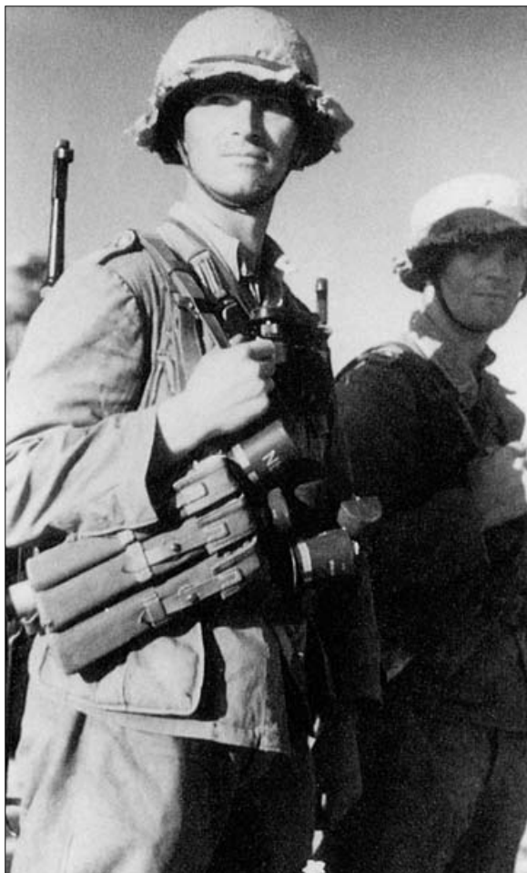
A Leutnant commanding an assault engineer platoon. Note the MP38/40 canvas ammunition pouches, the M1924 stick-grenades and the MP40 submachine gun slung over the shoulder. The officer has retained M1935 continental officers' field collar-patches and has covered his helmet with a rough hessian cover.

banded divisional reconnaissance battalions, and 'AA' battalions continued cavalry traditions.