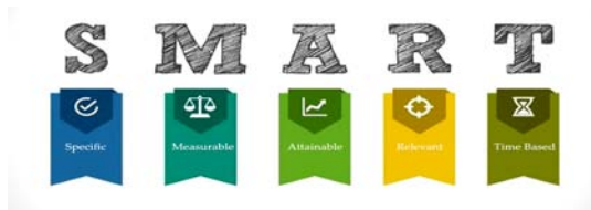
Figure 1. Goal Setting and action planning.