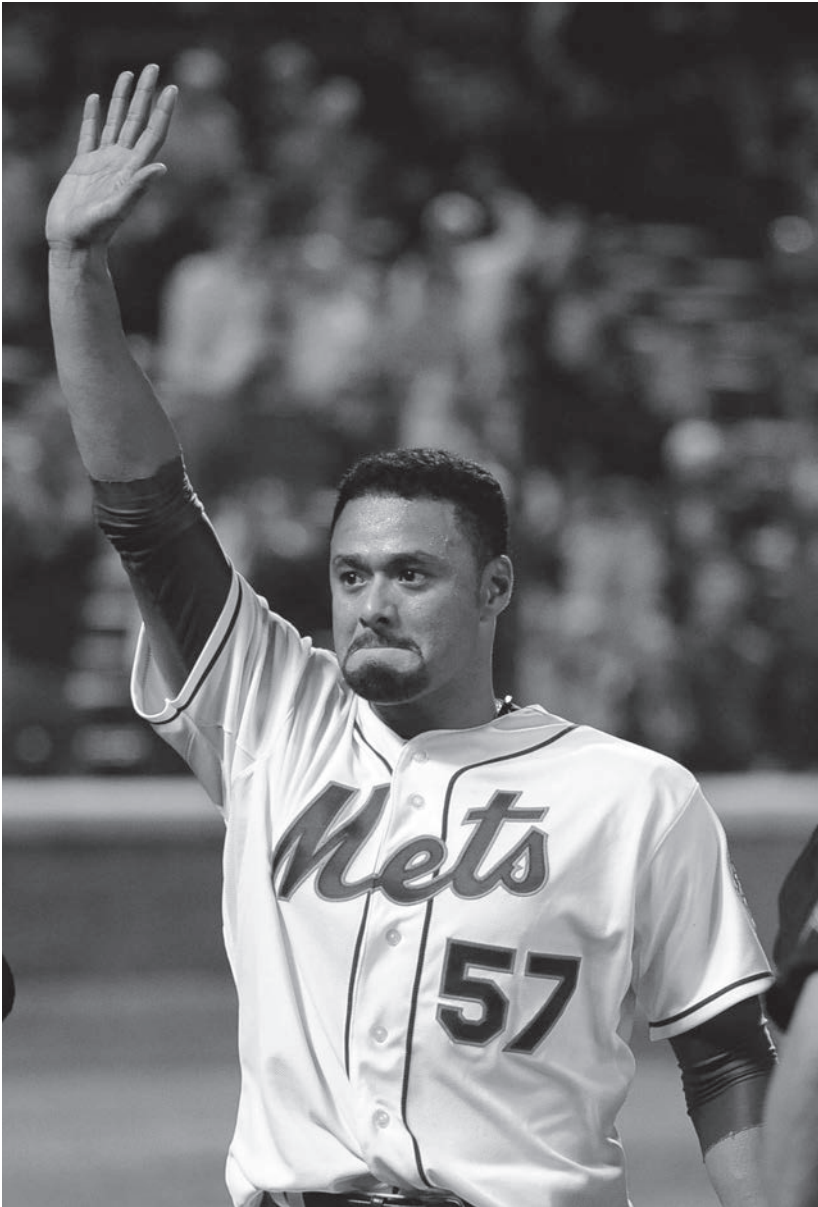
Johan Santana waves to the Citi Field crowd after finishing the first no-bitter in Mets history on June 1, 2012.