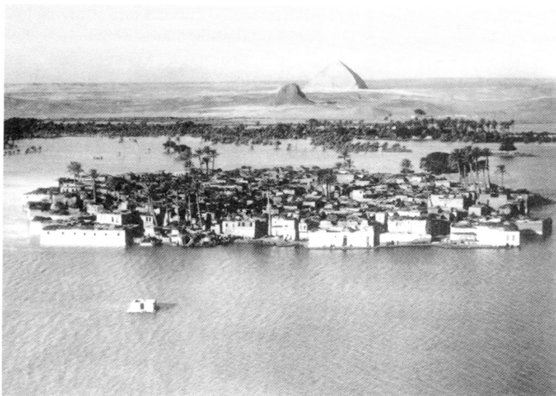
Figure 1.1. The Nile inundation at Dahshur: in the background are the ruined 'Black Pyramid' of Ammenemes I HI and the 'Bent Pyramid' of Seneferu Seneferu.

While the state cults – Amun of Thebes, Ptah of Memphis, Re of Heliopolis, and many more – had large full-time staffs, the far more numerous local deities often had their shrines manned on a part-time basis, whereby local people of a certain standing spent a number of months of the year serving as their god's priesthood. Thus, a priest will frequently also have been a farmer, a scribe, a soldier or a craftsman: religion was just one of a person's civic duties, rather than a specific vocation.