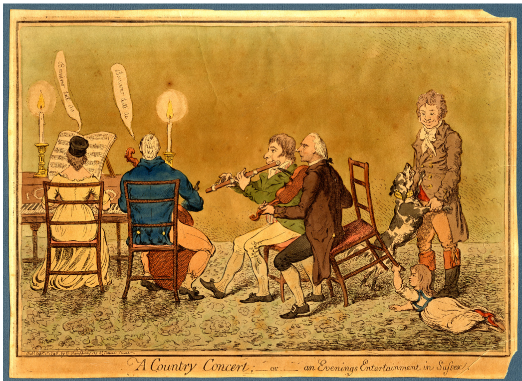
A Country Concert by James Gilray, c.1810. The musicians are performing Beviamo tutte tre , the popular drinking glee by Giardini