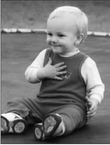
Young toddler signing PLEASE