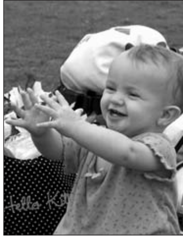
Toddler signing CELEBRATE

children. You will also find tips for successfully applying your new skills to home, daycare, and classroom environments. My fondest desire is that you find the process rewarding and that the young people in your life will be positively affected.