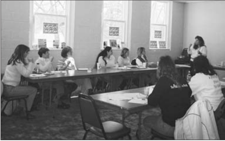
An ASL Class for child development therapists

basic American Sign Language (ASL) signs can facilitate more effective communication with their preverbal hearing children (see the selected references at the end of the book). Many ASL signs are iconic; in other words, the signs actually mimic the actions or behaviors that they represent. Therefore, the signs not only make sense, they also instinctively can become a very natural method of communication.