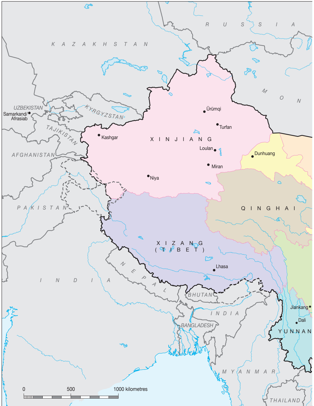
Map 1.1 Locations of Chinese provinces, autonomous regions, capitals and major cities.