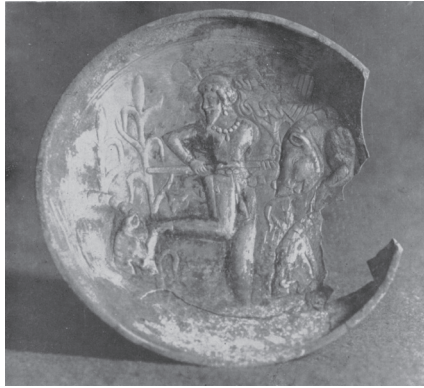
Figure 1.2 Sasanian plate, silver, diameter 18 cm, excavated in tomb of Feng Hetu, Datong, Shanxi, 504.