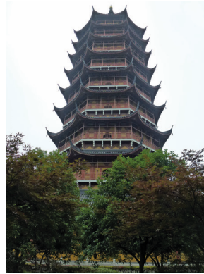
Figure 1.6e Pagoda, Bao'en Monastery, Suzhou, Jiangsu 1131–62.

as shown in Figure 1.6d, it sticks out, ever a reminder of the foreign origins of Buddhism, even though the religion was fully accepted and flourished in China independent of its Indian roots. A few minarets, similarly, would project above the walls of Chinese mosques as signs of the presence of a foreign religion.