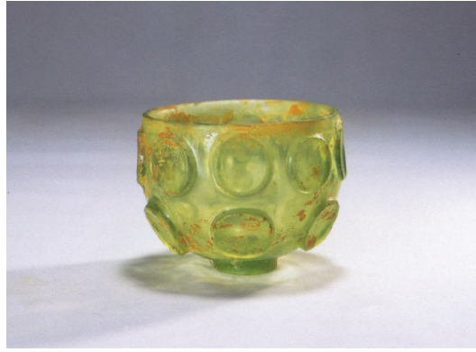
Figure 1.1 Sasanian glass, height 8 cm, diameter of mouth 9.5 cm, excavated in tomb of Li Xian (d. 569), Guyuan, Ningxia.