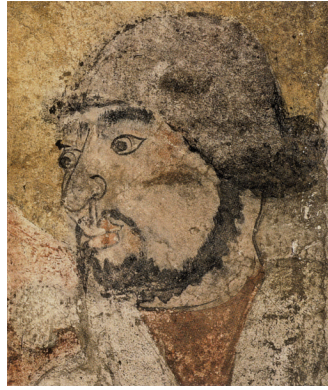
Figure 1.4 Swarthy male with large nose and heavy beard, identified by excavators as Hu. East wall, tomb of Xu Xianxiu (d. 571), Taiyuan.