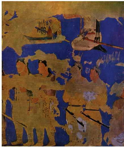
Figure 1.5 Men of Goguryeo. Detail of mural of ambassadors to the Sogdians, west wall, palace, Afrasiab, circa 650–75.

Asian continent probably brought images of peoples from the known world further than they had actually travelled. No written document confirms the presence of men of Goguryeo, the northernmost of the kingdoms of Korea's Three Kingdom's period (c. 57–668), in Samarkand. Yet they appear in a mid-seventh-century mural in a palace in Afrasiab (today Samarkand, Uzbekistan) whose subject has been interpreted as ambassadors of the world bringing gifts to the Sogdian king (Figure 1.5). 10