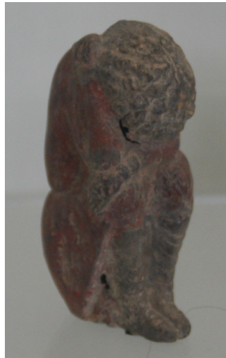
Figure 1.3 Figurine of man with curly hair and high boots, height 9.6 cm, painted pottery, excavated in tomb of Yuan Shao, Luoyang, Northern Wei, early sixth century.

understood as a statement that foreigners stood out among the Chinese population. Painters and sculptors captured the physical features and clothing of people who passed through or resided in China's cities. The figurine of a Westerner found in the tomb of Yuan Shao (d. 559), a descendant of royalty, in Luoyang, wears high leather boots and has curly hair (Figure 1.3). A man with black hair, a heavy beard and eyebrows, a large nose and wide eyes painted on the wall of a tomb in Taiyuan, Shanxi province, in 577, may be from as far west of China as Persia (Figure 1.4). Transmigration across the