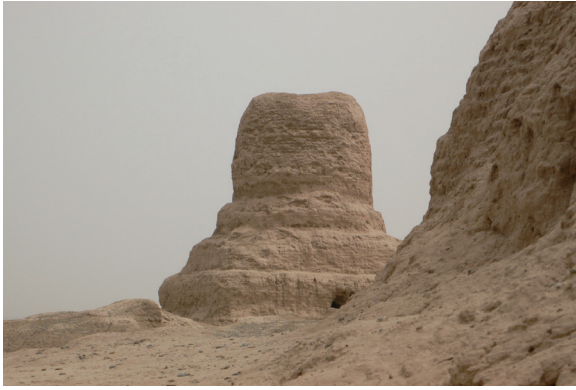
Figure 1.6c Mor Stupa, Kashgar, circa third century CE.

of this form could be multi-storey and decorated with facsimile pillars, beams and bracket sets that were moulded onto the surface and with imitation ceramic tile roofs at each level. Desiring height, Chinese builders turned to existing tall buildings for models. In the first and second centuries CE, those structures were ceremonial pillar-towers known as que at entries to palaces and along the paths to important tombs. It is impossible to know how many que stood in China when Buddhists arrived there, but they were certainly visible in the capital cities. Today about thirty survive. 31 Individual que had four-sided ground plans, and sometimes que were produced with two, three or even four linked, four-sided towers so that the base was a set of diagonally positioned quadrilaterals. Que is the most important native Chinese structure that influences pagoda construction (Figure 1.6b).