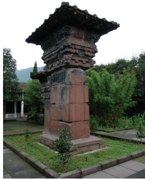
Figure 1.6b Gao Yi que, Ya'an, Sichuan, early third century CE.

the three fundamental structures of Indian Buddhist worship space were built in desert environments. One is the stūpa (hereafter stupa), the relic mound that symbolises the Buddha's death and comes to be called pagoda in East Asia (Figure 1.6a). 29 The second is the rock-carved worship space known as c(h)aitya and the third is the vihara , a cluster of cells for monastic meditation and residence. 30