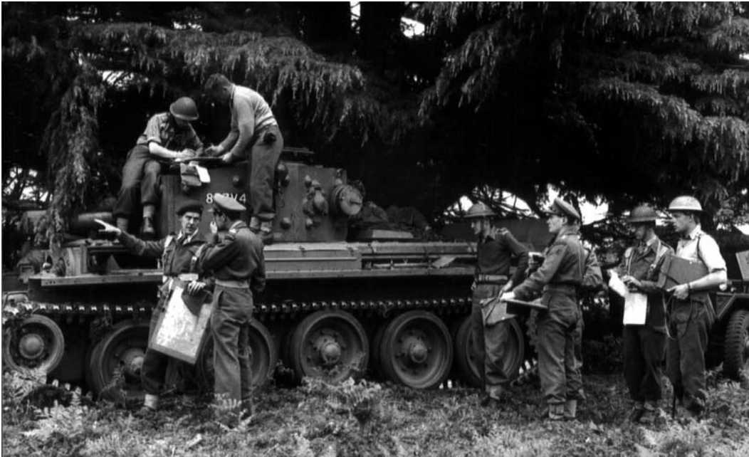
A Cromwell Mk.VIII of the 3rd/4th County of London Yeomanry in the 1950s. The Territorial Army's RAC regiments numbered over thirty between 1947 and 1961, and in 1947–1948 the number of units requiring permanent staff from the regular Royal Armoured Corps regiments (themselves short of manpower) put severe strain on the corps. Eventually, the needs of the TA units were met by the influx of former conscripts. After 1961, the number of TA units was steadily reduced and the TA's armoured formations disappeared. The 3rd/4th CLY was part of the 56th (City of London) Armoured Division, TA.

With the exception of the strategic reserve, these regiments were stationed on a mixture of established camps, or reoccupied decrepit wartime bases that had been vacated for two years. The regular RAC regiments assigned to training the part time soldiers did, by all accounts, an excellent job, but the price was high until the regular RAC regiments were up to their own manpower requirement. With detached squadrons spread around the country, RAC units training the TA fell below operational capability very quickly. The Queen's Bays, the 12th Lancers, the 14th/20th Hussars, the 8th Royal Tank Regiment and the 17th/21st Lancers all served as training units in 1948. The other repatriated armoured regiments dedicated to training the Territorial Army at various times soon included the 3rd Carabiniers, the 1st King's Dragoon Guards, the Life Guards, the 7th Hussars, the 8th Hussars, the 9th Lancers, the 2nd RTR and the 6th RTR. With the exception of the six regiments in BAOR, every regiment in the Royal Armoured Corps was well under strength. Poor equipment maintenance capabilities in the dispersed armoured squadrons quickly reduced vehicle availability, and inadequate accommodation in disused wartime camps added misery to boredom. 6