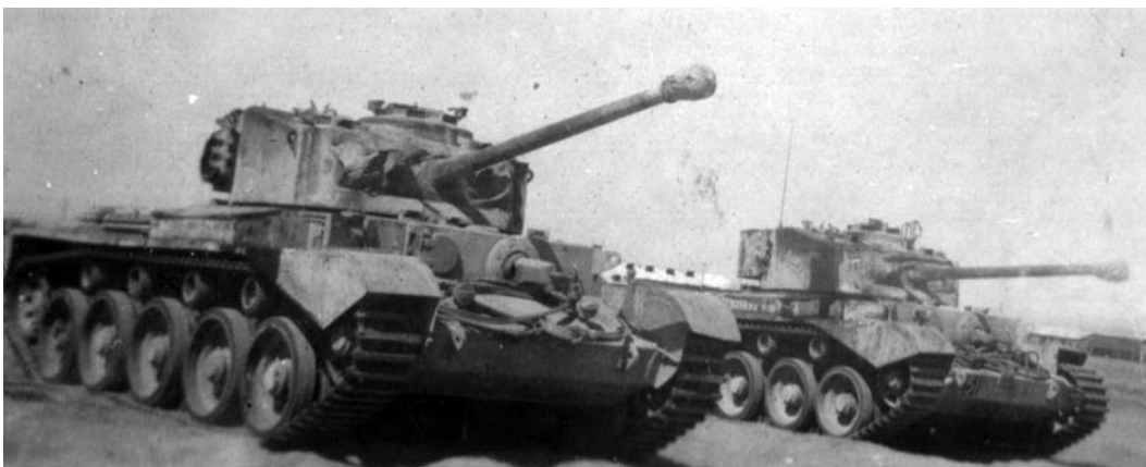
Two Bays Comets at Fanara, Egypt, 1947. The armoured regiments abroad in the years immediately after the war mostly received Cromwell and Comet tanks, although the Sherman was retained by units in India until they returned to the United Kingdom. (Brian Simpson)

of the empire. Five regiments were still in India, and eight were serving in the Middle East (half of whom were equipped with armoured cars). Smaller detachments were located in Hong Kong and Japan. The 4th RTR was sent to Palestine in 1948 equipped with Comet tanks to protect the final British withdrawal from Israeli attacks. In Malaya, where communist agitation had been a threat since 1945, the 3rd RTR had a small presence (with the bulk of the regiment stationed in Hong Kong). In the same year the 4th Hussars joined them on a three year assignment in armoured cars as the situation in the colony became more serious.