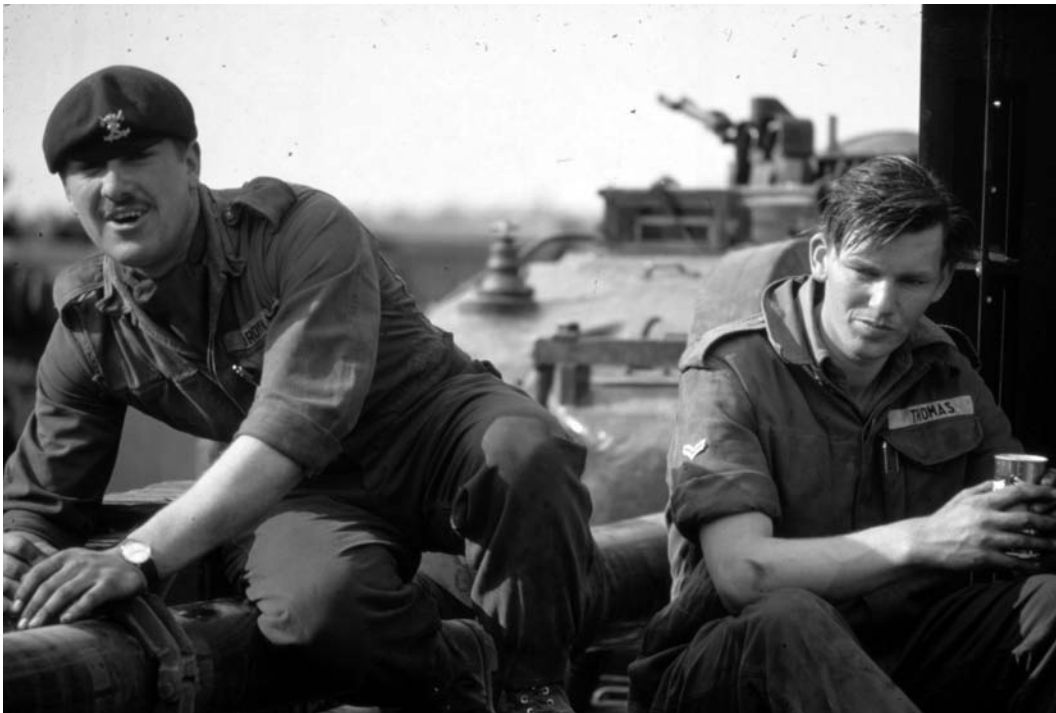
Some of the turret crew of a 9th/12th Lancers Centurion Mk.13 seen in 1967 during a break in a summer training period in West Germany.

A tank commander salutes while passing a saluting base emblazoned with Union Flags in 1952. This Centurion belonged to the 17th/21st Lancers and the occasion was the Queen's first birthday spent as a reigning sovereign. At this time the mailed fist was the emblem of the 6th Armoured Division, newly raised for service in West Germany.