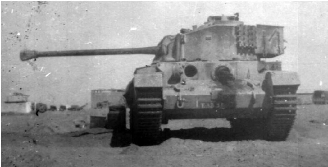
A Bays Comet at Fanara, Egypt in 1947. The Comet was only used in North West Europe during the war but saw worldwide service thereafter: (Brian Simpson)

It became impossible to keep a large enough force to intervene in Europe after 1946 while the army's budget shrank and its numbers dwindled. During this period the RAC's BAOR commitment was a weak force of six armoured regiments, which represented the only full strength regiments in the corps. For the five years leading up to the Korean War, manpower resources were pulled in so many directions that the supply of men could not keep pace with the British Army's needs. The RAC was doomed to suffer from manpower shortages with the rest of the army. The government and the General Staff were aware of the need to re-equip, but the process had a slow start while larger issues were addressed. Prime Minister Attlee's government broke with established traditions by creating a separate Ministry of Defence in 1947. This was significant because the Prime Minister had usually combined the Defence Minister's portfolio with his own, although the War Office continued to dictate military policy. The simplification of controlling the army was a positive move that made decision making more efficient. The Royal Armoured Corps also rationalised its establishment, improving administrative functions at its Bovington Centre.