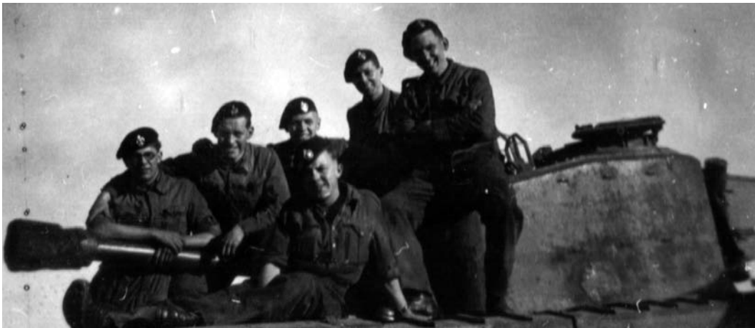
The end of the Second World War, and the start of a new era. A group of recruits from one of the Training Regiments RAC photographed seated on a Churchill Mk.VII in 1946 at Lulworth. The Churchill is probably a vehicle returned from the continent, and exhibits repaired battle damage on the turret side.