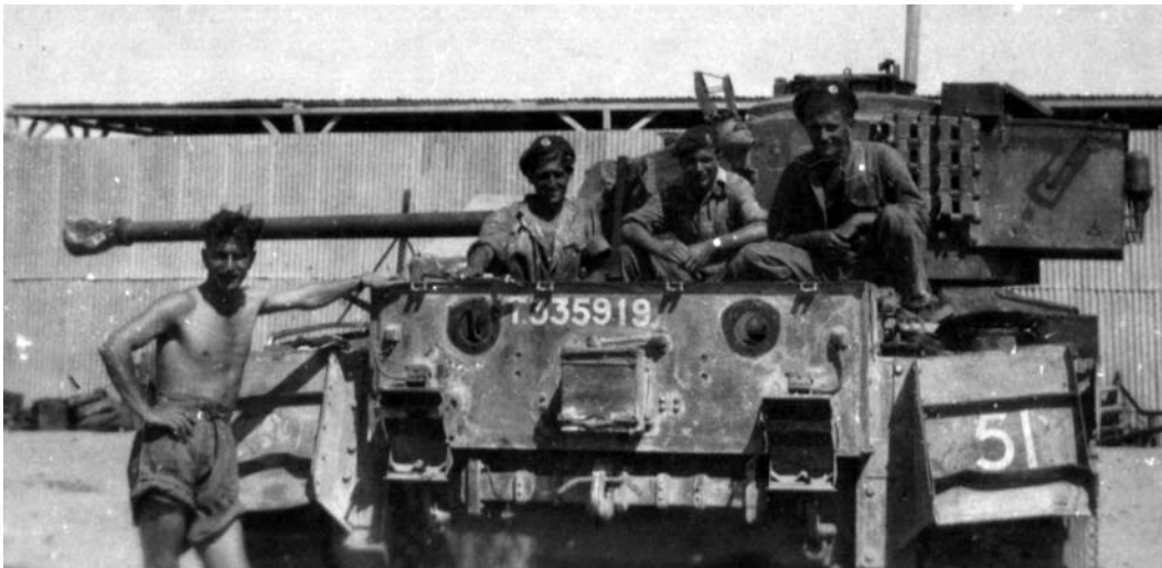
Comet T-335919 with fitters sitting on the engine deck in the workshop area of the Bays' tank park in Fanara, Egypt in 1947. The Comet was a good vehicle for its time and replaced most of the British Shermans after the war. The Bays moved to Palestine, Egypt and Libya in 1947 and finally returned to England in October 1947. (Brian Simpson)

of the empire. Five regiments were still in India, and eight were serving in the Middle East (half of whom were equipped with armoured cars). Smaller detachments were located in Hong Kong and Japan. The 4th RTR was sent to Palestine in 1948 equipped with Comet tanks to protect the final British withdrawal from Israeli attacks. In Malaya, where communist agitation had been a threat since 1945, the 3rd RTR had a small presence (with the bulk of the regiment stationed in Hong Kong). In the same year the 4th Hussars joined them on a three year assignment in armoured cars as the situation in the colony became more serious.