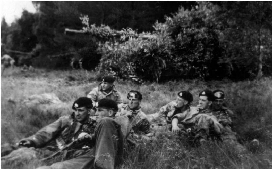
Crews of the 17th/21st Lancers at rest in long grass during an exercise in 1951. A camouflaged Centurion can be seen in the background. The men wear a mixture of khaki and camouflage denim tank suits, and pixie suits.