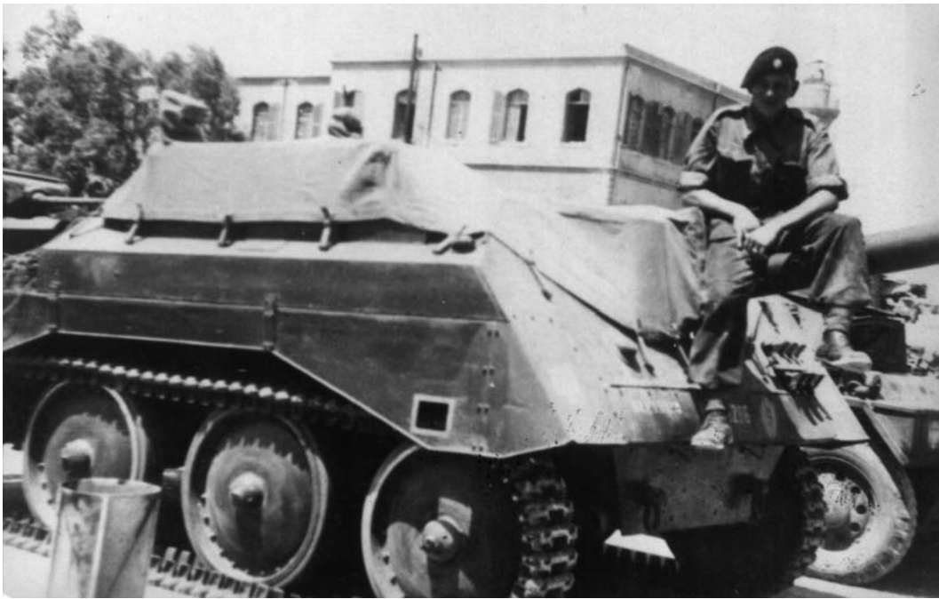
A few Alectos were used overseas with armoured regiments in the Middle East and Italy after the war. The tarpaulin in this photo is to keep the gun breech dust-free. (Brian Simpson)

The Daimler Dingo Scout Car was retained in service after the war until the late 1950s. In postwar armoured regiments both the Dingo and the wartime Humber were used for liaison purposes; these examples belong to the Queen's Bays. In this 1947 photo taken in Egypt the vehicles are marked as belonging to the senior regiment in the 1st Armoured Division. (Brian Simpson)