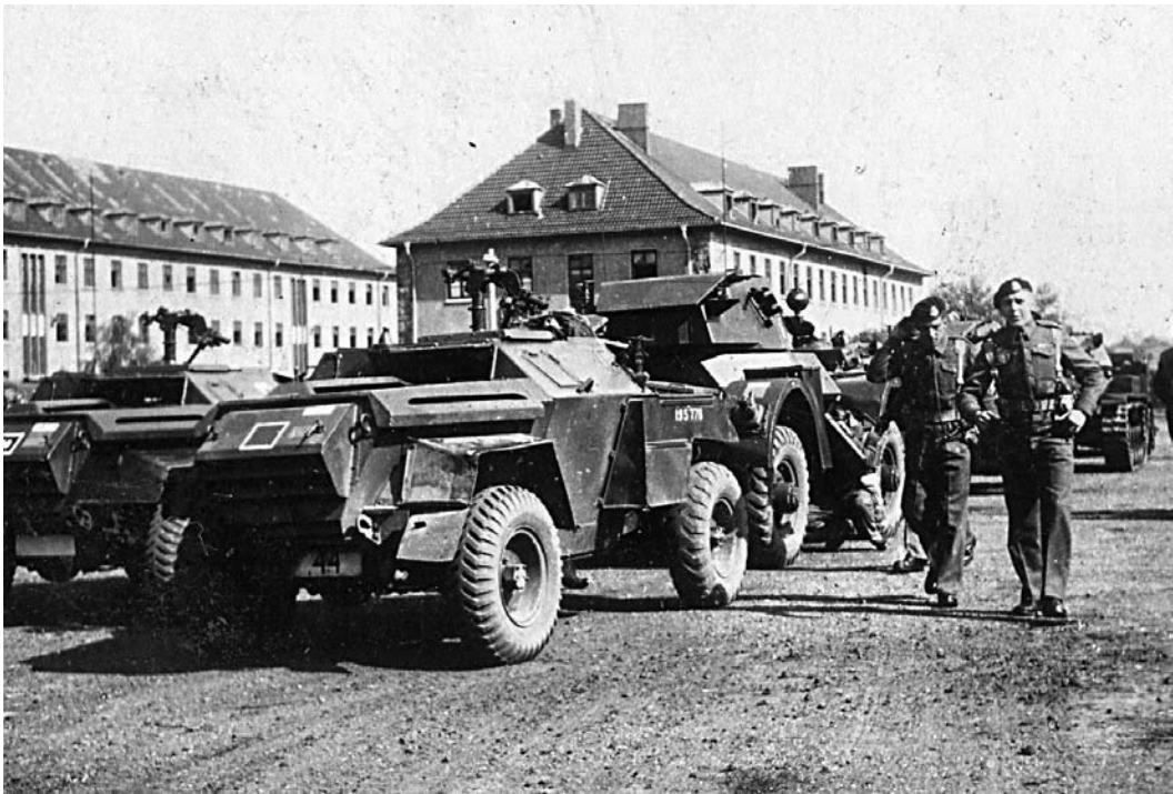
Two Humber scout cars of the 13th/18th Hussars parked at the barracks at Wolfenbuttel in 1946 or 1947. Also pictured in the background are a Daimler Armoured Car and one of the Chaffees. The 13th/18th Hussars finished the war with the 8th Armoured Brigade on Shermans, but within a year they were under orders of the 5th Infantry Division on armoured cars, with only enough men to form two squadrons.

units had finished the war overseas – mainly in Italy, the Middle East, India or northern Europe. The rapid disbandment of these units led to some administrative difficulties and to the assignment of occupation duties throughout Europe to the remaining RAC regiments on the continent. In the last months of 1945 and for much of 1946 there was a whirlwind of personnel changes in the individual regiments, and many unit movements. The armoured units in the 8th Army and the 21st Army Group became widely dispersed across Western Europe in the course of occupation duties.