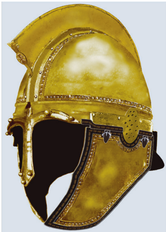
Reconstruction of one of the helmets found at Koblenz (grave 1), with a Chi-ro christogram and metallic crest, dating from the second half of 4th century AD. From the time of Constantine the Great, many Christian soldiers displayed christograms on their weapons and armour. Constantius II was a deeply committed Arian Christian, continuing his father's policy of promoting Christians to the high offices of state.