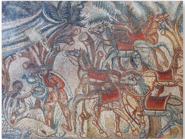
A Late Roman lord out hunting with soldiers and servants, Villa Romana del Tullaro, Sicily.