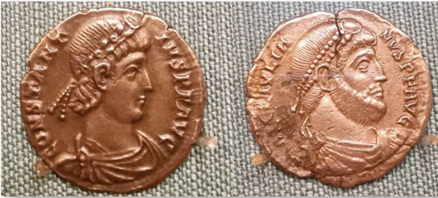
Two golden solidi , the one on the left showing Constantius II, while the right-hand side coin depicts Julian. (Kunsthistorisches Museum, Vienna; authors' photo, courtesy of the museum)

points along the frontiers, through the distinction between the Limitanei or Ripuari (soldier-settlers anchored to a particular frontier territory) and the Comitatenses (forces quartered in cities). The latter formed the mobile troops who could accompany the emperor in a campaign or reach the most threatened sectors of the empire's frontier, in collaboration with the border troops. Under his rule, defeated barbarians were integrated into the army, offering many Germanic warriors the opportunity to forge a career in the imperial forces and even reach the highest command ranks. On the other hand, it must be remembered that it was an Alemannic king, Crocus, who raised Constantine up onto the shields of his warriors – the Auxilia of the army of Constantius Chlorus – and proclaimed him emperor in the aftermath of his father's death.