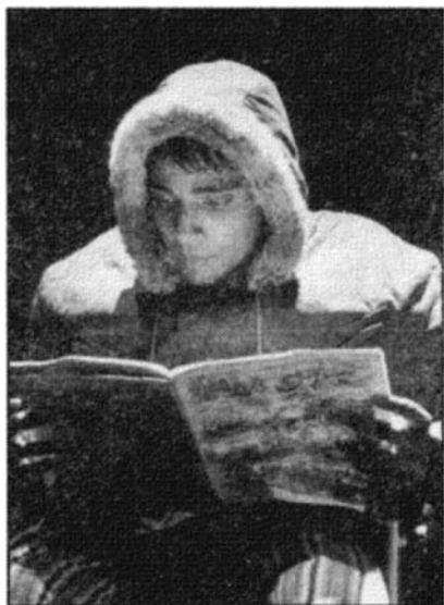
EAST IS EAST by Ayub Khan-Din