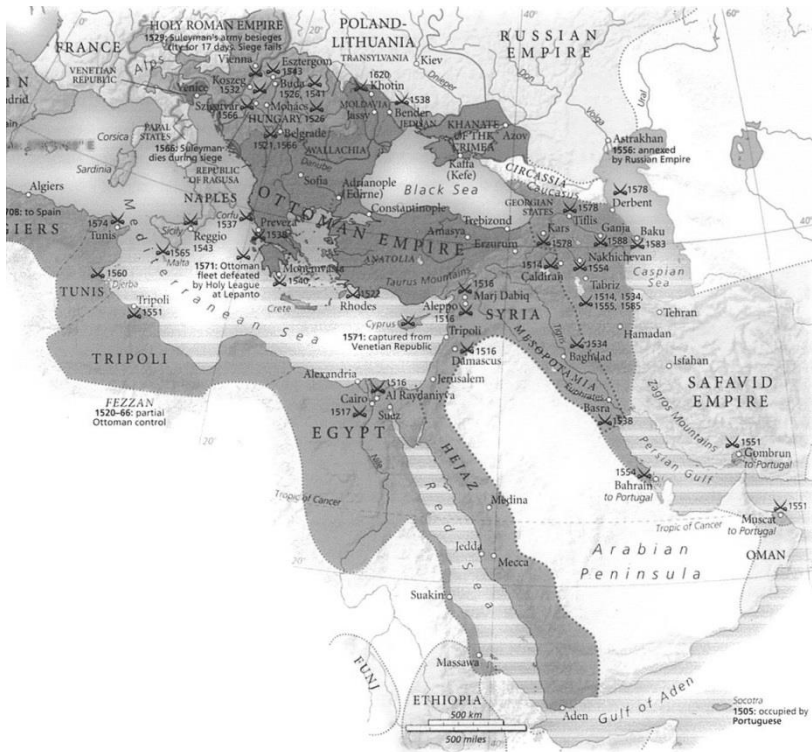
Figure 1: The Ottoman Empire during the time of Süleyman the Magnificent (1520–1566)