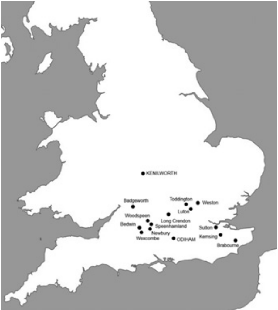
Figure 3 Eleanor's Principal Marshal Manors in England. The castles of Kenilworth and Odiham which Eleanor received as gifts from Henry III are also shown.