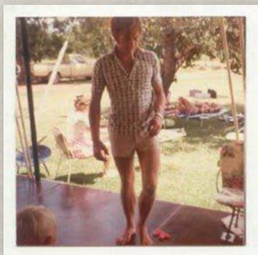
On the farm.