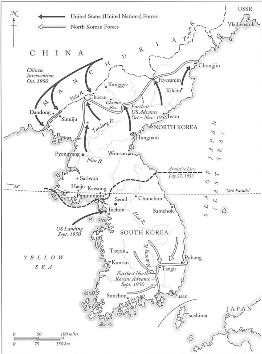
Map 4 The Korean War, 1950-53