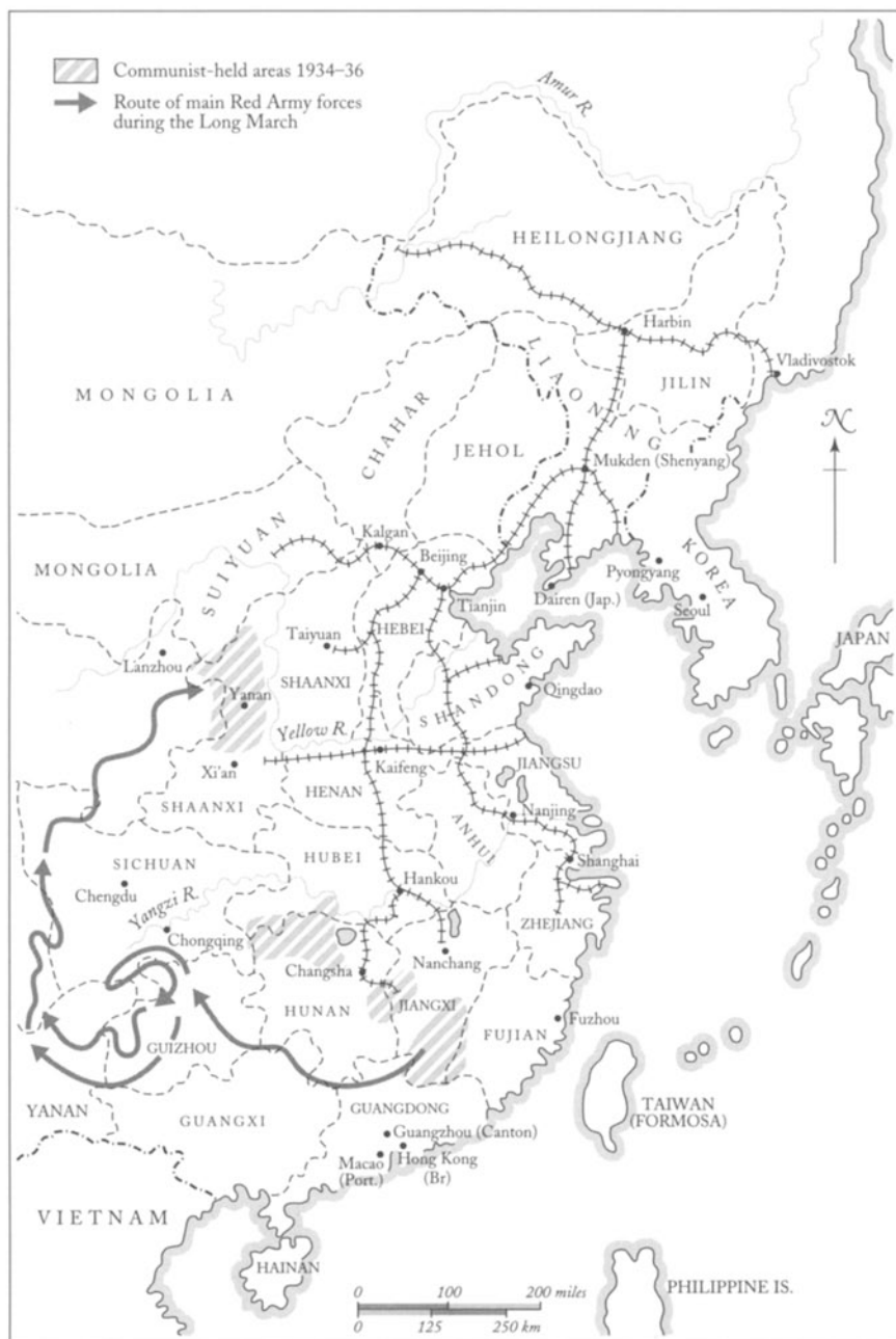
Map 1 China and Korea