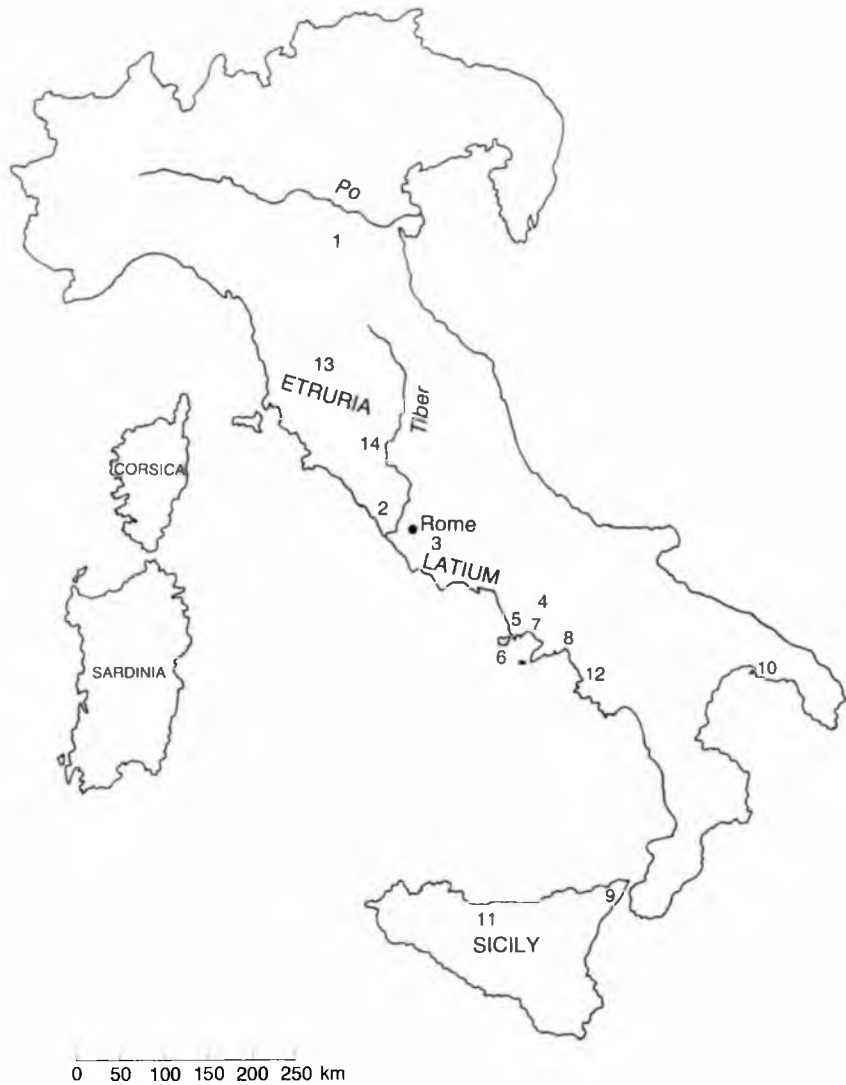
Figure 0.1 Italy. 1, Bologna; 2, Caere; 3, Alban Hills; 4, Capua; 5, Cumae; 6, Ischia; 7, Naples; 8, Pontecagnano; 9, Messina; 10, Tarentum; 11, Himera; 12, Poseidonia; 13, Murlo; 14, Acquarossa.