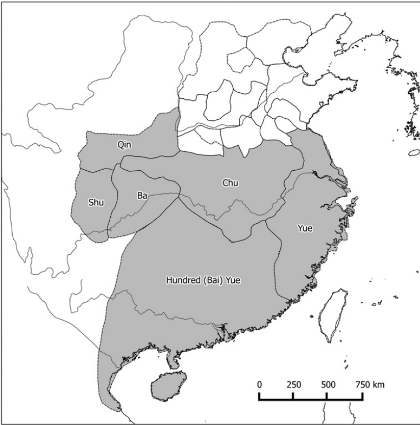
Map 2: Warring States China, 350 BCE (drawn by Dan Shultz).