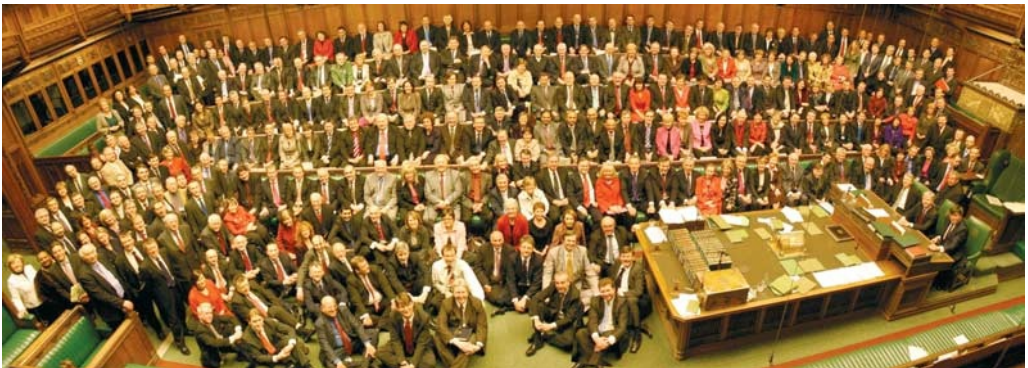
100 years on. The 2006 PLP photographed in the Chamber of the House of Commons, February 2006.