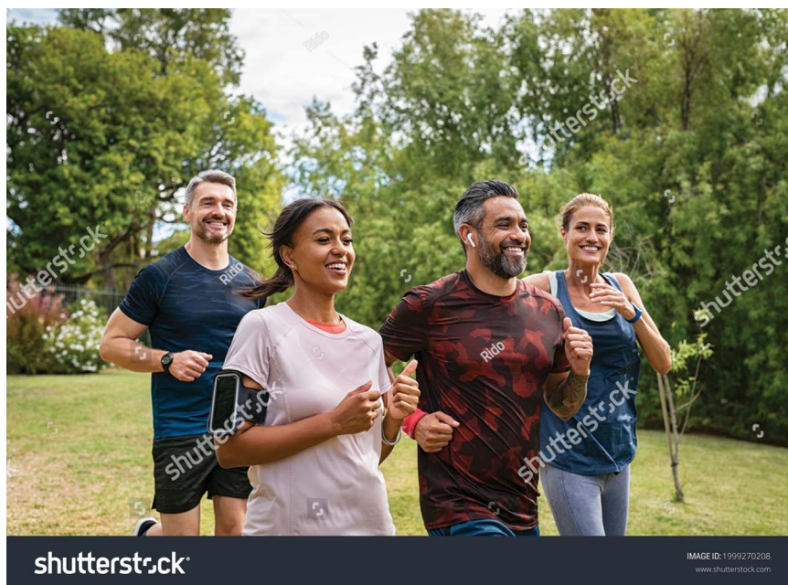
FIGURE 2.1 Behavioral strategies have been used effectively to help people persist in physical fitness programs