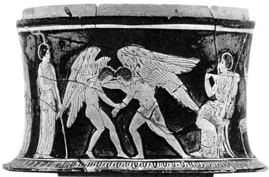
Figure ii Eros and Anteros Wrestling . Vase.