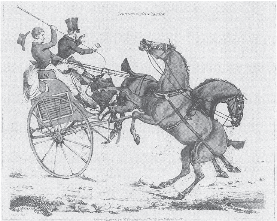
Learning to drive Tandem Henry Alken, 1823