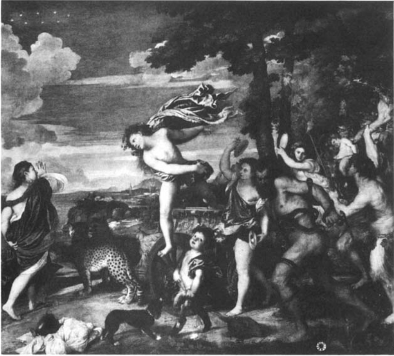
Titian, Bacchus and Ariadne .

National Gallery, London. Reproduced by permission of Alinari/Art Resource, New York.