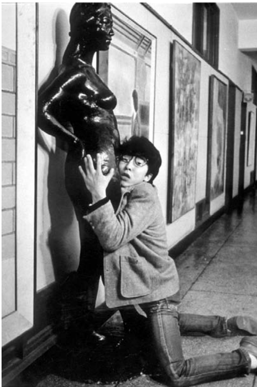
An explicit scene of male sexual anxiety. Whale Hunting (1984).