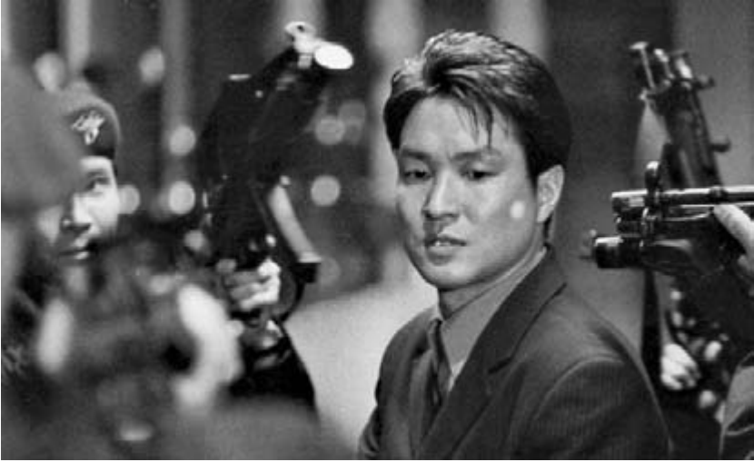
Agent Yu signals a departure from the traumatized male character of the 1980s. Shiri (1999).

and masculinity. And the longing for an ideal male hero became integrated in the production of a new symbol for Korea in the era of industrialized, modern, and global subject formation.