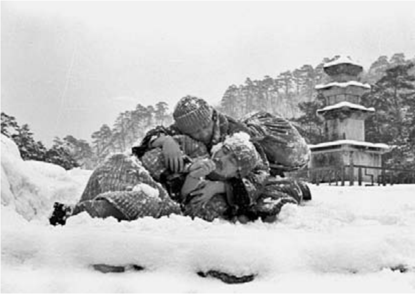
Pöb-un (right) chooses a monastic life to escape his oedipal anxiety. Mandala (1981).