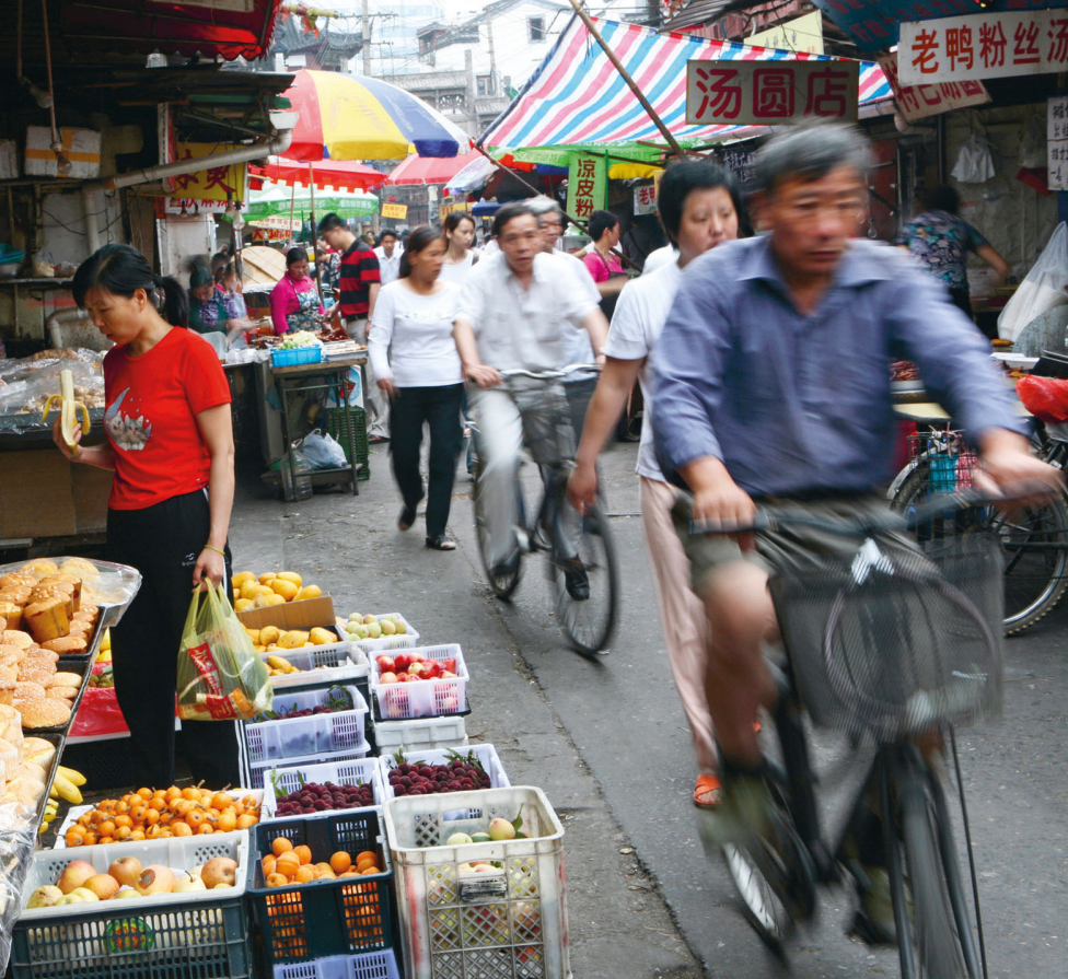
STREET SCENE IN THE OLD CITY