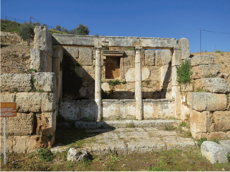
The fountain-house of the gymnasium at Sicyon, which was built by Cleinias, the father of Aratus, when he was effectively the sole ruler of the city.

settle their claims for reparations, more than Sicyon could afford. He approached Antigonus Gonatas, the king of Macedon, with whom his father had been on reasonable terms, but Antigonus prevaricated. It was, in fact, a cheeky appeal by Aratus, since Nicocles, the tyrant he had ousted, had enjoyed tacit support from Antigonus, as had his predecessors. Everyone knew this, but the fact that Antigonus had left it tacit gave Aratus his opening. Aratus was planning to restore to Sicyon a large number of enemies of Macedon, turning it into an anti-Macedonian stronghold. It is no wonder that Antigonus prevaricated.